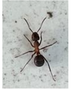
Narrow Headed Ant 30 points