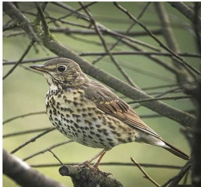
Song Thrush 15 points