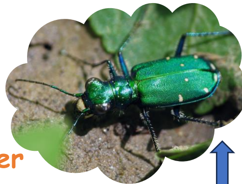
Green Tiger Beetle 20 points