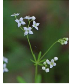
Hedge Bedstraw 15 points