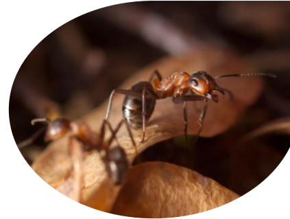
Wood Ant 10 points